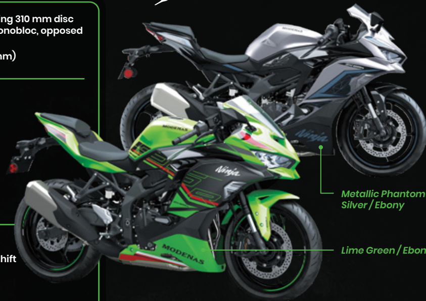
Metallic Phantom Silver / Ebony