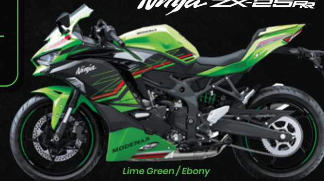
Lime Green / Ebony

* Specifications are subject to change without prior notice